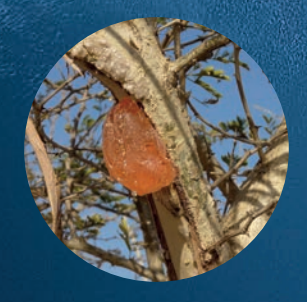
Dried sap of Acacia senegal