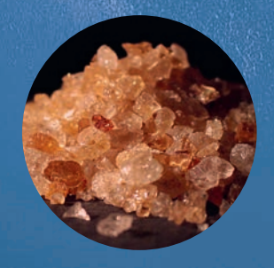
Granulated gum acacia