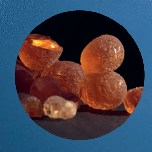
Cleaned lumps of gum acacia